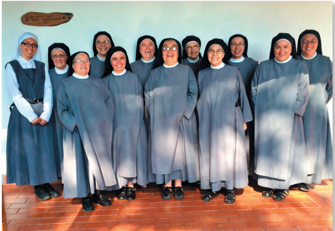
The Benedictine Community in Rautén, Chile.

We are deeply grateful for the mutual expressions of gratitude and the beautiful exchange of gifts shared with our African Benedictine Sisters from our twinning communities at St. Agnes Convent in Chipole, Tanzania and St. Gertrude Convent in Imiliwaha, Tanzania, and with our South American friends at Monasterio Santa Maria in Rautén, Chile. Though we are miles apart, our hearts and Benedictine spirit remain closely united through mutual generosity, prayers, and enduring friendships.