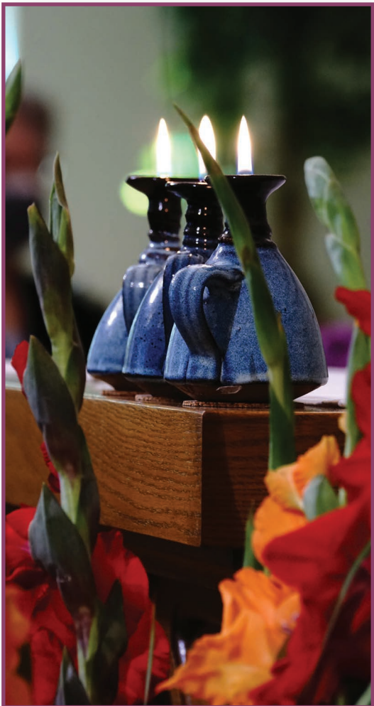
Three lamps on the altar symbolize their life in the Spirit.