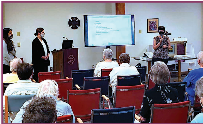
HGA architects presenting plans and processes