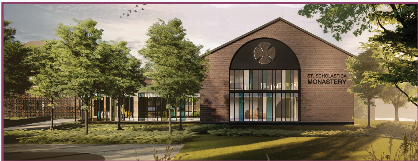
Architectural rendering of future monastic home