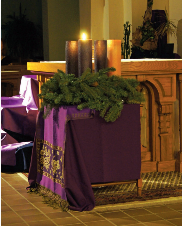
First Vespers of Advent

“The daily commitment to the Liturgy of the Hours is one of the central elements of Benedictine prayer life and spirituality. We are there at prayer, whether seen or unseen, by the larger community around us as a manifestation of ecclesia orans , the praying Church.”