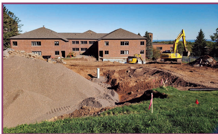
McGough Construction transforms our back lawn to become the new approach to the Monastery.