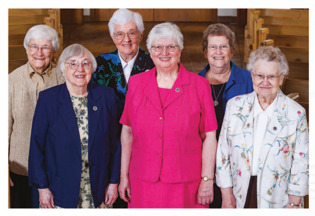
To all who make contributions, we live and grow because of you.